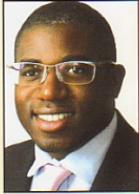
David Lammy MP Parliamentary Under-Secretary for Culture