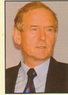
Barry Sheerman MP Chair of the Select Committee on Education and Skills