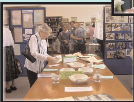
Old girls examine the exhibits