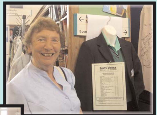
School uniform display