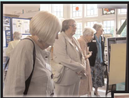
Visitors to the 125th Exhibition in the library

Thursday 9th July 3:20p.m. - Victorian themed Charity Fete.