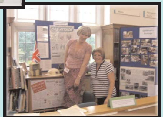
Preparing for the exhibition