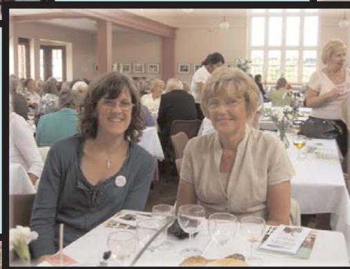
Old Edwardians' Reunion Lunch Saturday 28th June