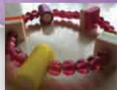
It has had a busy few weeks, attending official

Young Enterprise trade fairs selling to members of the public. The company has been to both the Touchwood Shopping Centre in Solihull and the Sutton Coldfield Gracechurch Mall. At Touchwood, the team sold their products with considerable aplomb taking in the highest sum of money out of all of the stalls.